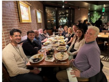
Internet2 2026 Community Exchange