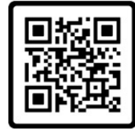
CC & Dine Around Sign Up

Get paired with a Community Connector & Sign up for a small group dinner (Dine Around): https://forms.gle/WHZC6BzSSapVmScB9